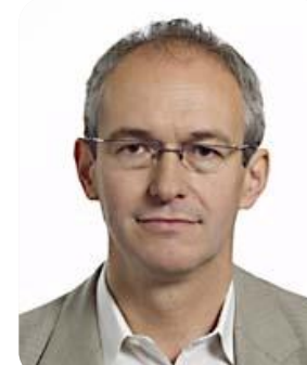
Richard Corbett (S&D, UK)