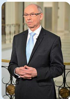
Janusz Lewandowski (EPP, PL)