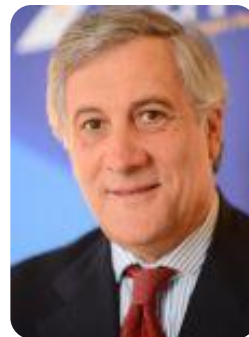
Antonio Tajani (EPP, IT)