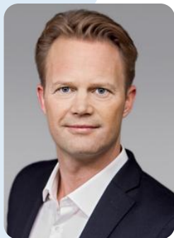
Jeppe Kofod (S&D, DK)